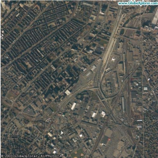
BU Bioterrorism Lab (proposed) SouthEnd/Roxbury, Boston, MA

Compare the location of the proposed BU bioterrorism BSL4 lab to the location of the three existing BSL4 labs: