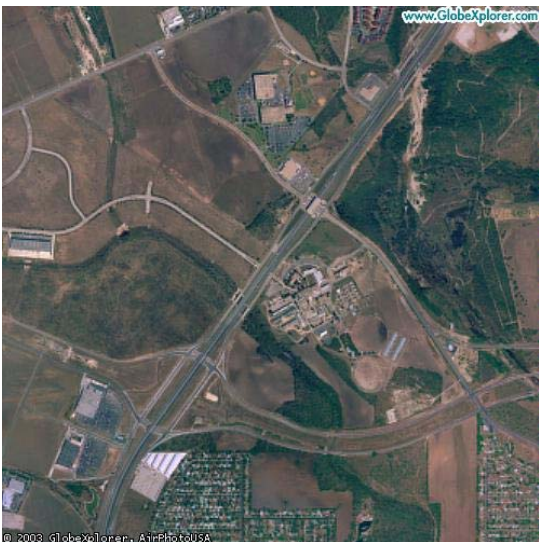
Southwest Foundation for Biomedical Research, San Antonio, TX